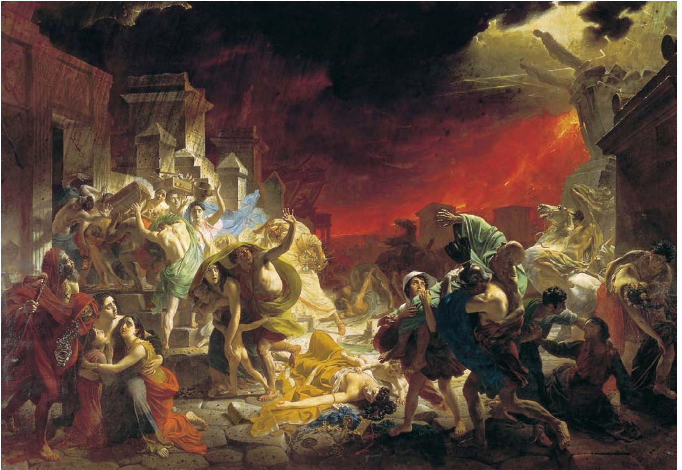
A natural disaster (“The Last Day of Pompeii” by Karl Briullov)

stitute (SRI) – the major laboratory studying paranormal effects. Experiments resulted in creation of equipment functioning on the basis of the principle of multiplication of initiating signal upon decomposition of metastable states. Later on this equipment, as well as analogous designs, was called as “brain machines” (metatrons). From the physical point of view, “brain machines” are a system of electronic oscillators resonating at the wave-length of electromagnetic radiation, which energy is adequate to destruction energy (entropic potential) of dominant connections maintaining structural organization of the system researched.